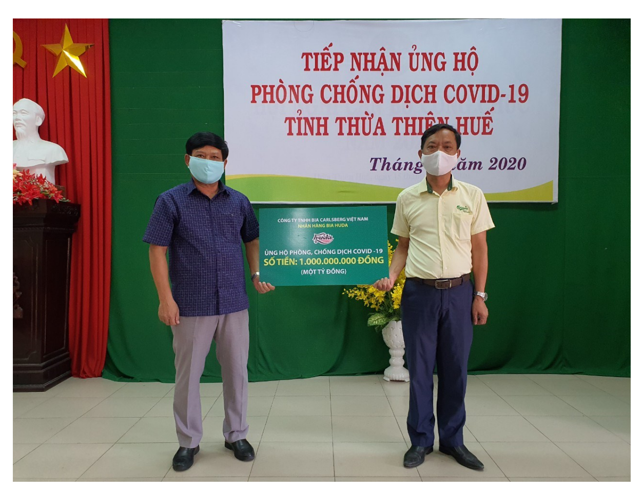
Caption: Donation hand-over ceremony from Carlsberg Vietnam to Thua Thien Hue province

Lô B8 KCN Phú Bài Phường Phú Bài Thị xã Hương Thủy TT Huế Tel: +84 234 3850164 Fax: +84 234 3850171